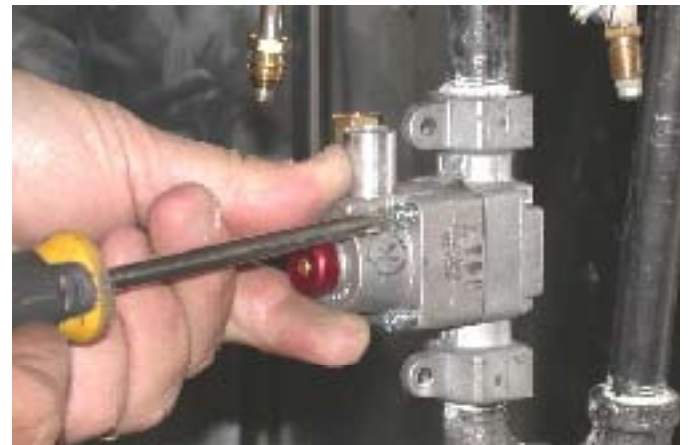
10. Mount the safety head and replace the screws.