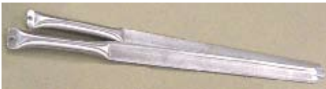
Item No. MBRS-2 MBR Sword

Chefs may also use spatulas or long square wooden sticks as implements on the surface. Like a wok or cast iron fry pan, the top must be reseasoned with each use. Food should not be allowed to remain on the top as this will cause the top to pit or otherwise deteriorate.