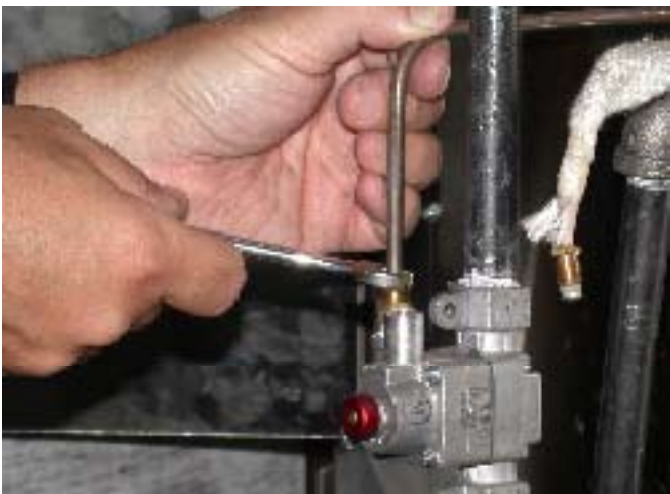
11. Carefully thread the brass fitting from the pilot gas line into the body and tighten using a 1/4" wrench.