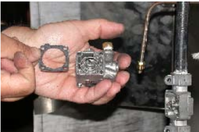
9. Install the new safety head with the new gasket provided.