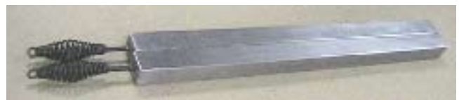
Item No. MBR-VS2 MBR Veggie Stick