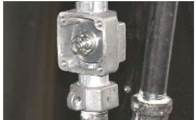
8. New spring/magnet assembly installed.