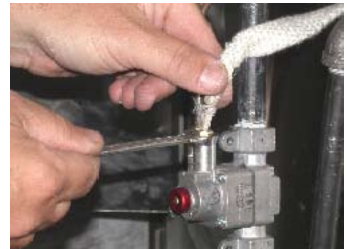
12. Thread the thermocouple fitting into the body by hand. When you can no longer tighten by hand, use a 3/8" wrench to make snug. A good rule is 1/8 after finger tight. DO NOT OVERTIGHTEN as it will damage the control. Turn on gas, check for leaks, and relight pilot.