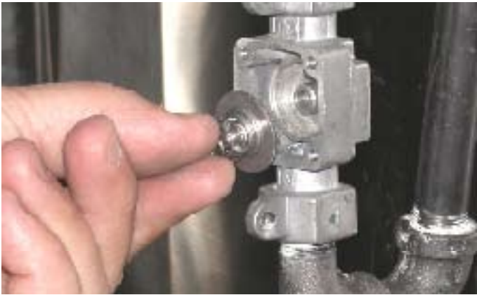
7. Remove and replace the spring/magnet assembly.