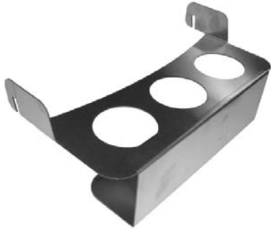
MBR HOLSTER FOR BOTTLES MBR-HLSTR