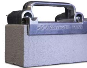
PUMMICE CLEANER FOR MBR TOPS MBR-CLNR