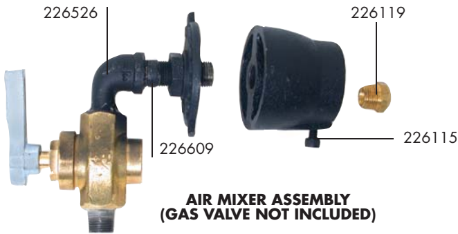
AIR MIXER ASSEMBLY (GAS VALVE NOT INCLUDED)