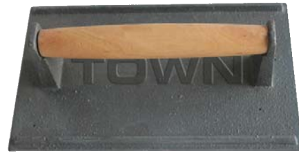
CAST IRON GRILL PRESS 48690