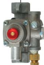
3/8" NPT SAFETY 249011