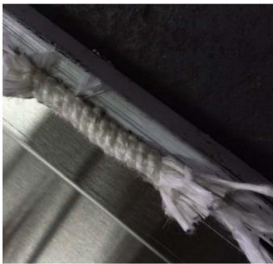
Figure 1 - Before cutting existing replacement door gasket