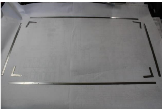
Figure 4 – Layout of retaining strips provided