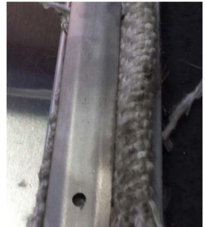
Figure 3 – Placement of parts