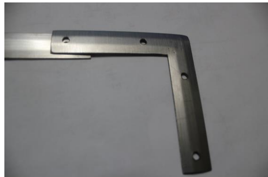
Figure 5 – Overlap of corner and side strips