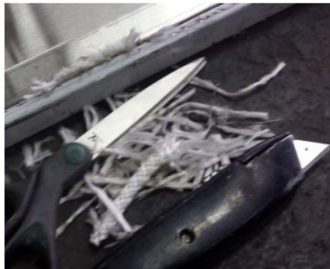
Figure 2 – After Cutting existing door gasket