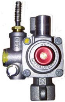
TS11 pilot safety