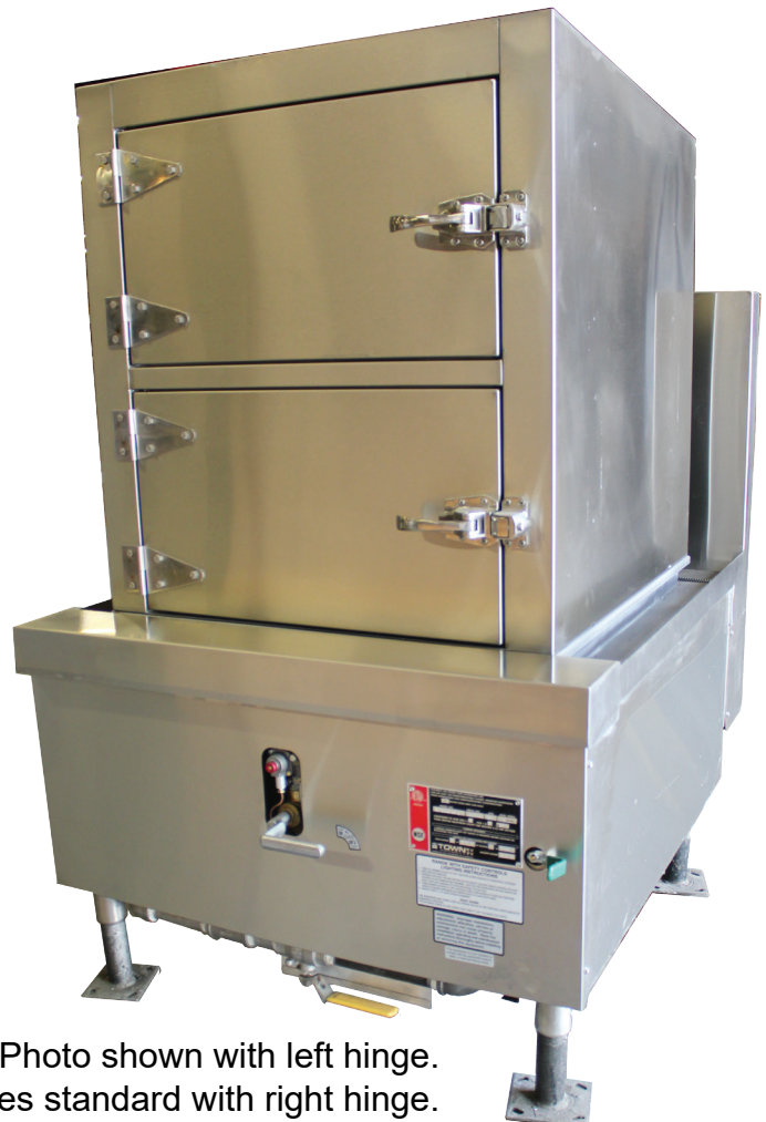
Photo shown with left hinge. Comes standard with right hinge.