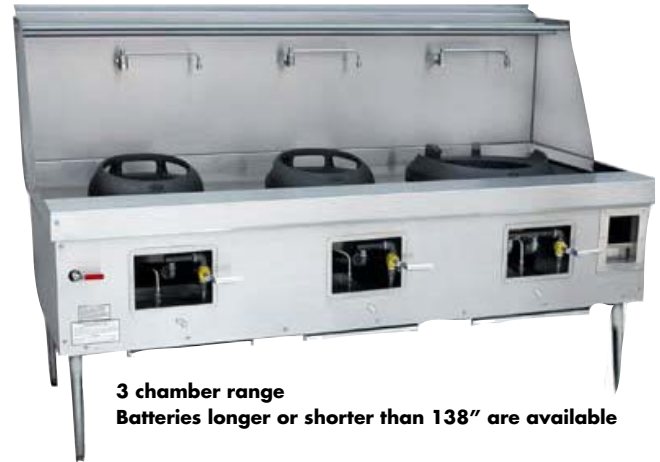
3 chamber range Batteries longer or shorter than 138" are available