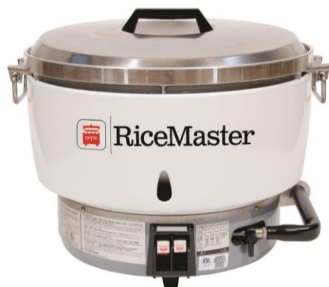
RM-55N-R (NAT GAS) RM-55P-R (LP GAS) 55 CUP GAS RICE COOKER, NSF & ETL