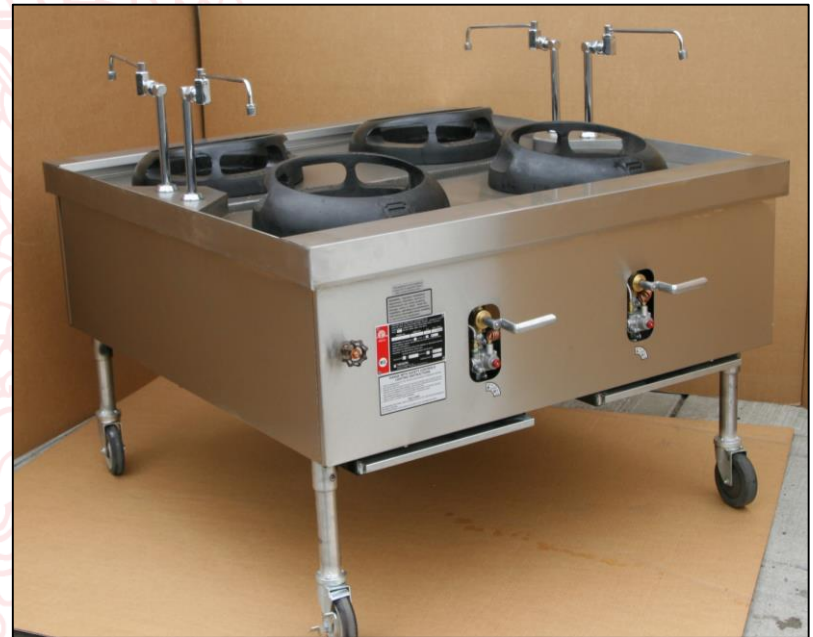
Figure 1- Georgia Southern University / Porter Khouw