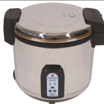
57130 (120V) 57131 (230/208V) 30 CUP COOK & HOLD RICE COOKER